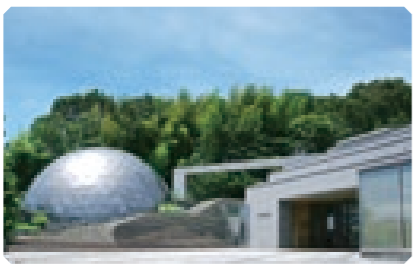
Higashi-yamato City Folk Museum (Higashi-yamato City)

An abundance of nature remains in the area around Lake Tama and Lake Sayama, which straddle the boundary between Tokyo Metropolis and Saitama Prefecture. This is an oasis where you can encounter the nature and beautiful scenery of managed woodland.