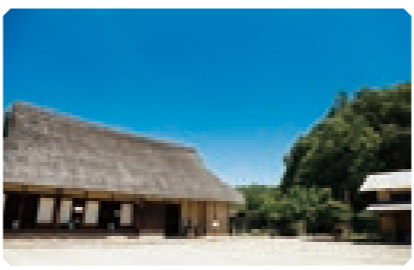
Tokyo Metropolitan Noyamakita/ Rokudoyama Park (Musashimurayama City / Mizuho Town)

A colony of over 200,000 dogtooth violets, a rarity in the Tokyo area. When spring arrives, beautiful dogtooth violet flowers cover an entire slope around 3000m 2 in area. 📍 243-1 Komagata Fujiyama, Oaza, Mizuho Town, Nishi-tama District ☎ 042-557-7659 (Construction Section, Urban Development Division, Mizuho Town) 9:00 - 17:00 (until 16:00 between November and February)