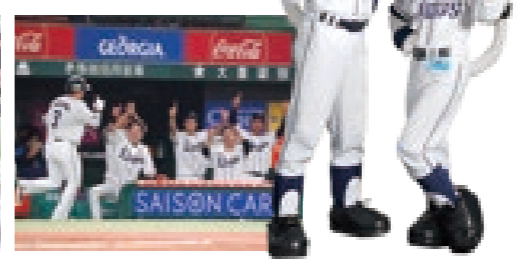
© SEIBU Lions / TEZUKA PRODUCTIONS