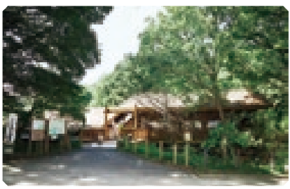
Saitama Midori-no-mori Nature Park (Iruma City)

The entire park is covered by mixed forest including pin oak and sawtooth oak, and you may catch sight of various wild birds and insects. The 1.9 kilometer One Path, which runs from east to west along the boundary between Tokyo and Saitama, has just the right amount of ups and downs, making it ideal for walking or hiking. 📍 2/ 3 Suwacho/ 2 Tamakocho, 3/4 Noguchicho, Higashi-murayama City ☎ 042-393-0154 (Sayama Park Center) 8:30 - 17:30