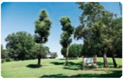
Tokyo Metropolitan Hachikokuyama Park (Higashi-murayama City)

A park on the eastern side of Lake Tama (Murayama Reservoir), where the managed woodland scenery and nature of Musashino still maintain a strong presence. With wild and cultivated cherry trees as well as the Yoshino variety, it is a beloved cherry blossom-viewing location. 📍 3-17-19 Tamakocho, Higashi-murayama City ☎ 042-393-0154 (Sayama Park Center) 8:30 - 17:30