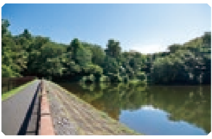
Tokyo Metropolitan Sayama Park (Higashi-murayama City / Higashi-yamato City)

The museum's main theme is "Living with the Sayama Hills". Projects related to the area's history, folklore, and nature take place not only within the building but throughout the Sayama Hills. 📍 1-260-2 Narahashi, Higashi-yamato City ☎ 042-567-4800 9:00 - 17:00 Closed Mondays and the day after a national holiday (except where this falls on a Saturday, Sunday, or national holiday)